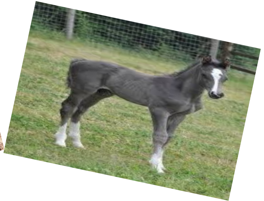
Stockton Junior High Stallions