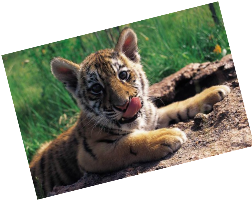
Peet Junior High Cubs